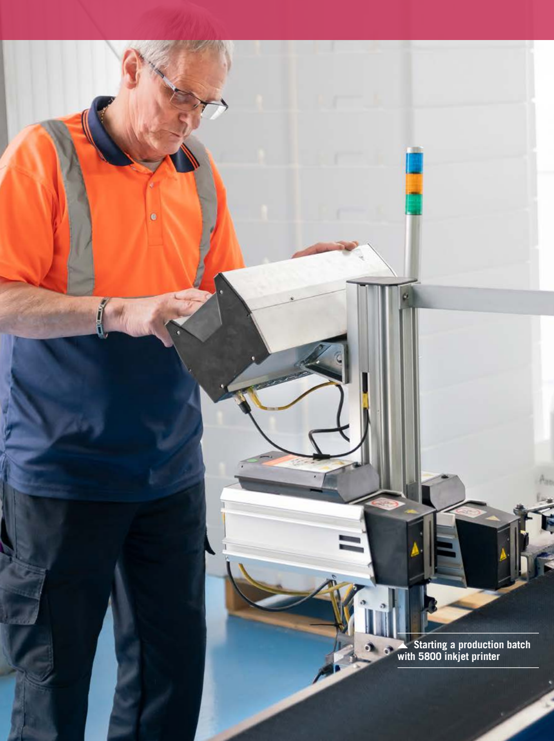
Starting a production batch with 5800 inkjet printer